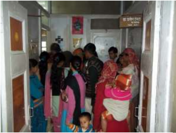
Glimpse of CHC Mathana district Kurukshetra