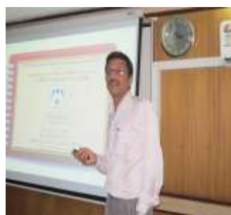
Participant of the 17 th PDC presenting best port folio during valedictory session