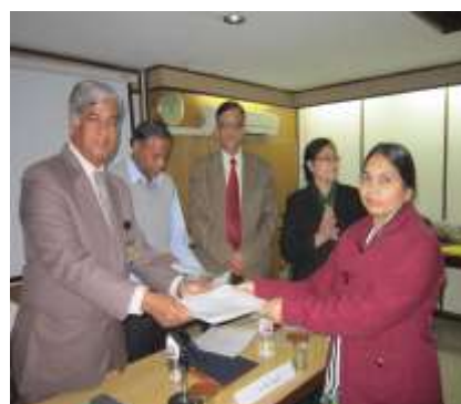
Participant of the 17 th PDC receiving course certificate from Deputy Commissioner (Training), MoHFW, GoI