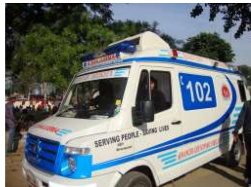
102 Ambulance Services in Haryana

Team visited PHC: Pinjore on 19 th December 2012. This PHC covered the 57,902 population (29295 Rural +28607 Urban), 82 Villages, 19 Gram Panchayats, 19 Village Health and Sanitation Committees, 07 SCs, 61 AWCs, and 20 ASHA s.