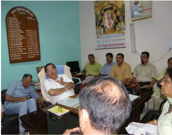
Participants at CMO office, Lucknow, Uttar Pradesh

The faculty and the participants of the PDC spent a lot of time directly interacting with ASHAs and AWWs. It was felt that ANM should be updated in term of knowledge and skills for conducting Ante Natal Clinic and delivery at the sub-centre. The visit to the sub centre Thabrail offered an excellent opportunity to the participants to discuss all field operational aspects with ANM/AWW and ASHA and also interact with community to understand their perception of the service being provided by the Health Department.