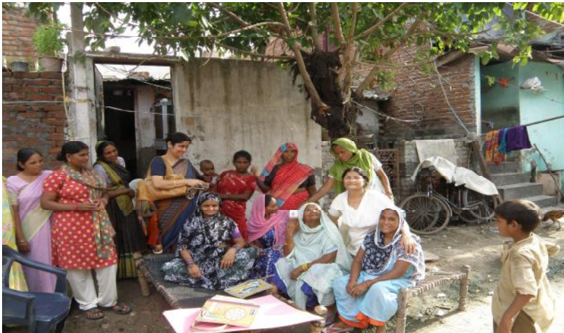
Interaction with Community Member at Lucknow, Uttar Pradesh

The faculty and the participants of the PDC spent a lot of time directly interacting with ASHAs and AWWs. It was felt that ANM should be updated in term of knowledge and skills for conducting Ante Natal Clinic and delivery at the sub-centre. The visit to the sub centre Thabrail offered an excellent opportunity to the participants to discuss all field operational aspects with ANM/AWW and ASHA and also interact with community to understand their perception of the service being provided by the Health Department.