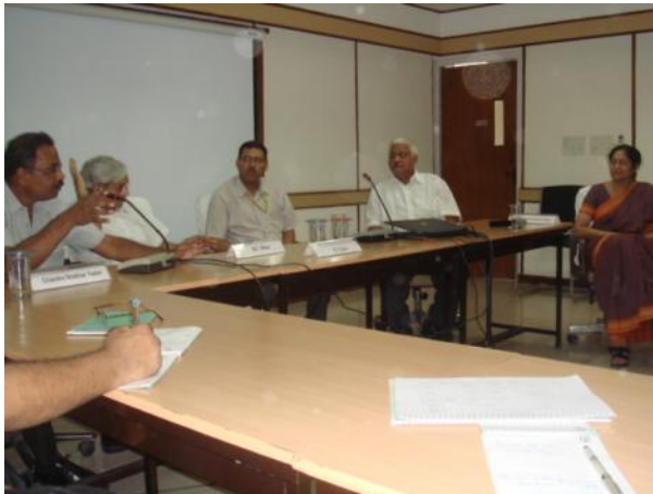
Panel Discussion on Quality Care in Hospitals

A session on Essential Drugs was also taken by Prof. J.K. Das in which he stressed upon different government Acts and Rules, important terminologies and schedules, points to remember and practice procedures to purchase and store drug and equipments. He also stressed that it is important to try to improve knowledge and create awareness, check the expiry date and storage of all drugs at proper place.