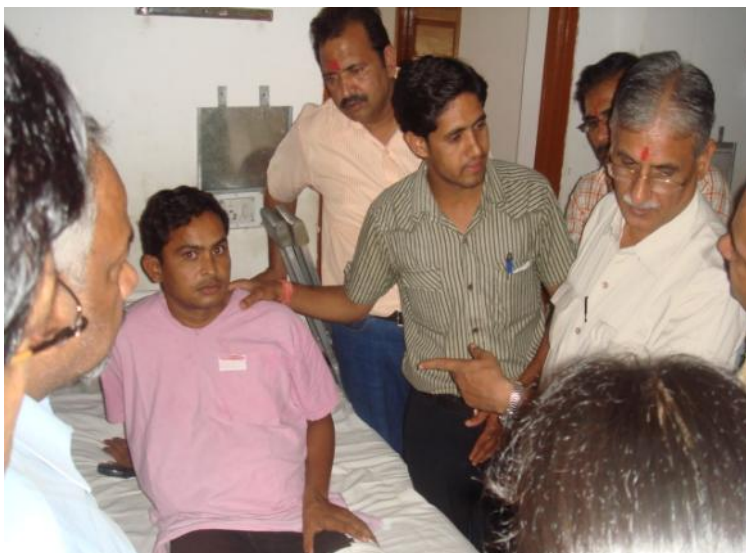
Participants Interacted with Patient and Staff at Narayan Sewa Sansthan, Udaipur

The Centre is being run by an NGO-Chiktsa Jyoti trust. It caters to 25-30 patients daily. It only runs OPD services. The staff was being paid a salary by NRHM. Ante-natal care and immunization is being given here. Family planning methods like Copper T insertion is done. There was no awareness of biomedical waste management. This centre was not doing much for the public and this partnership does not show much advantage regarding MCH services. The team was of the opinion that such arrangements do not benefit much.