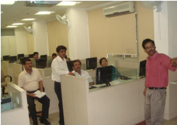
Computer Class in Progress

The computer classes started as usual with introduction to computer, MS Word, MS Excel, Power-Point, Internet, in regular sessions.