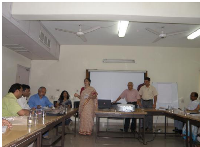
A Class in Progress

A half day visit to NAZ foundation was organized to observe how the home-based care programme for HIV/AIDS children is run by the NGO with meager financial support by the Government.