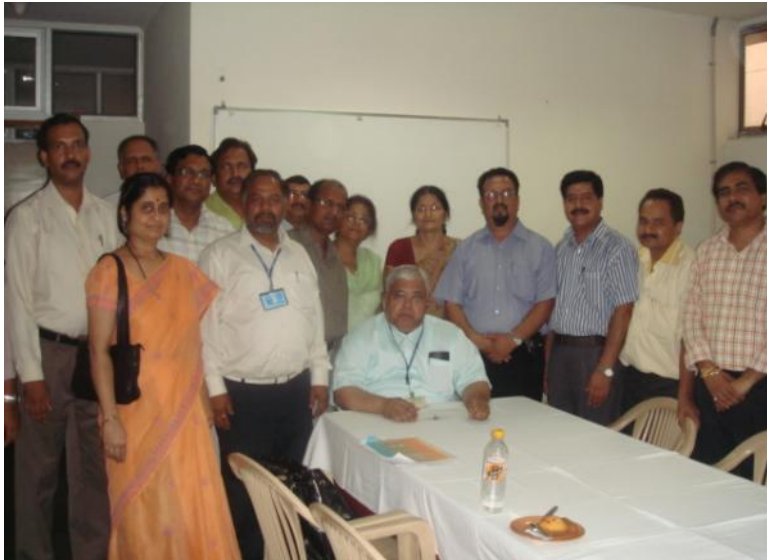
In the Holy Family Hospital with Director of Holy Family

A visit to Holy Family Hospital an ISO certified, 300 bedded and average 800 OPD attendance hospital was organized to describe to the participants different aspects of quality management in a hospital like client and provider friendly facilities, quality of infrastructure & service, team-work, capacity building and work culture.