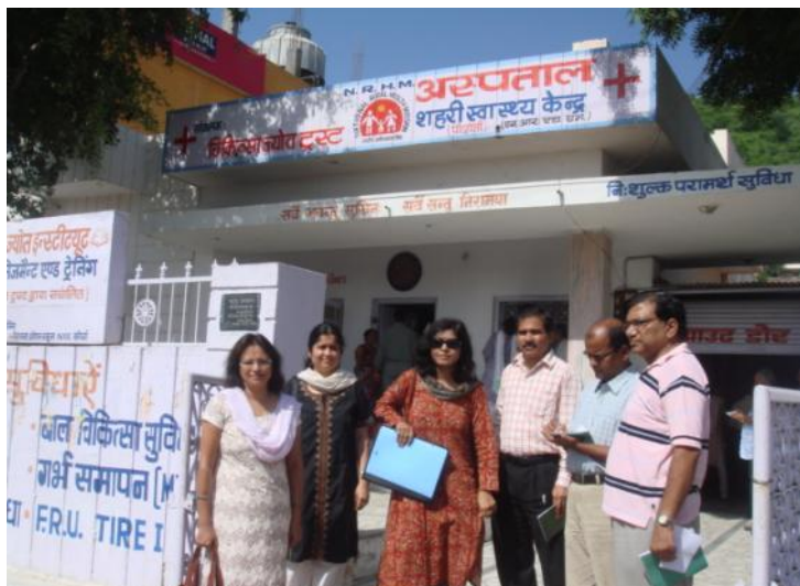
Participants and Faculty at a Facility During Field Visit Udaipur

The team also visited the “School Child Health Care Programme” under Shaala Swasthya Programme in Udaipur itself. This provides comprehensive health care to government school children supported by Government of Rajasthan and Nandi initiative